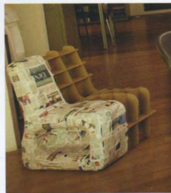
DESIGN FIRM, EZEQUIEL FARCA